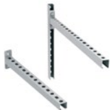
Wall rail supports SPWR